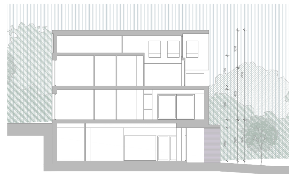
BLOCK C - SECTION BB SCALE 1:200@A1