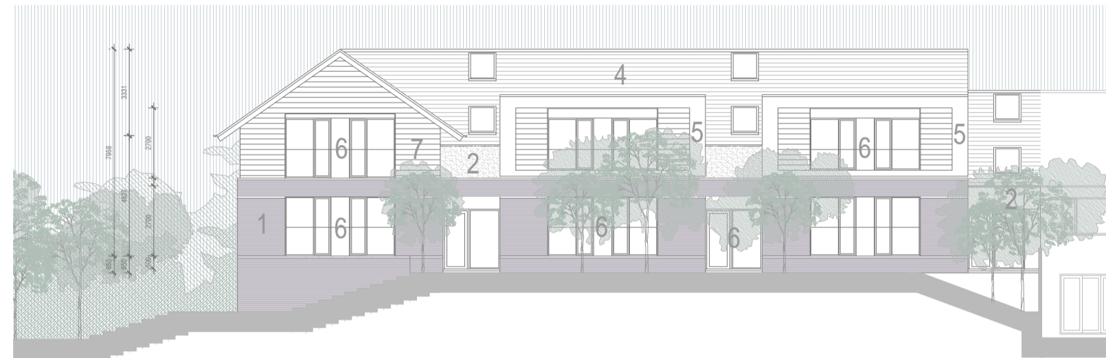
BLOCK C - REAR ELEVATION SCALE 1:200@A1