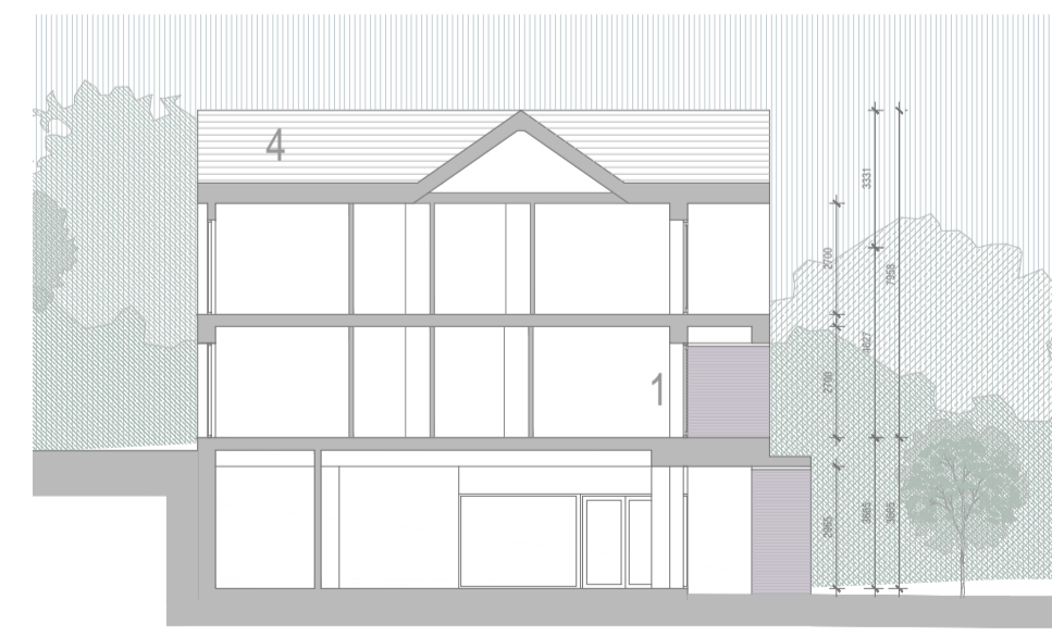
BLOCK C - SECTION CC SCALE 1:200@A1