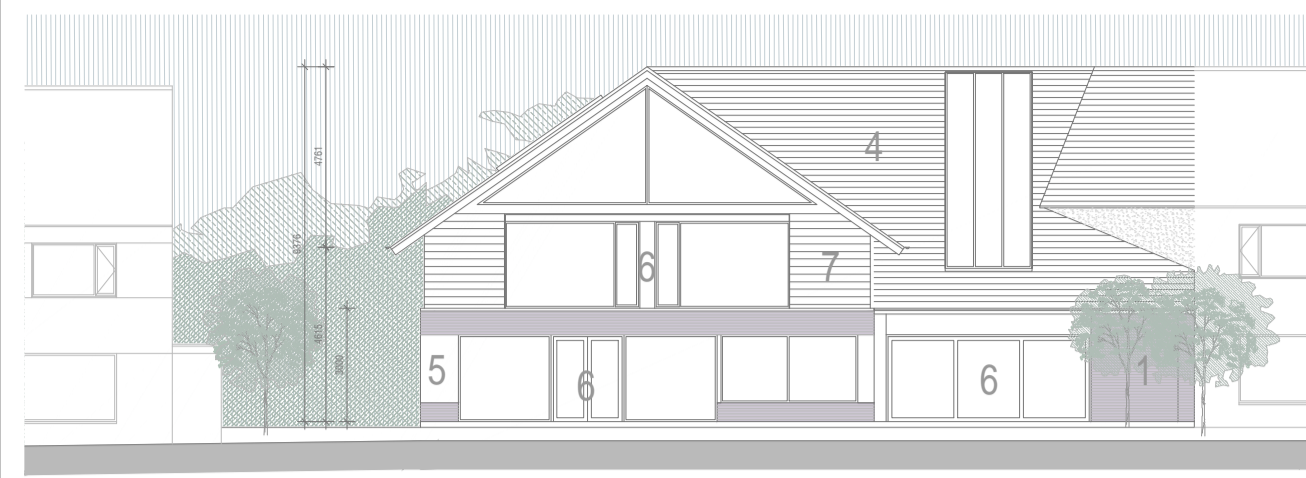
CRECHE - FRONT ELEVATION SCALE 1:200@A1