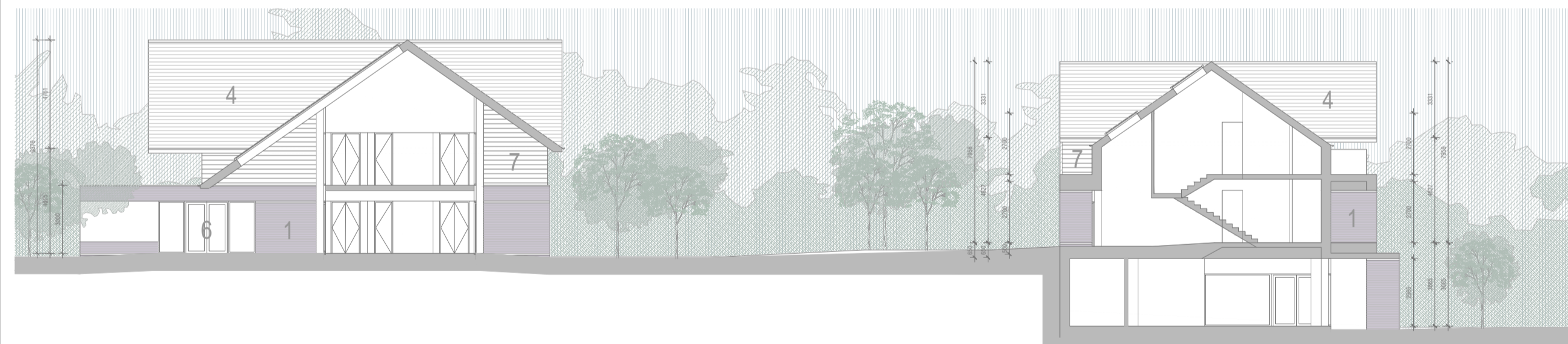
CRECHE & BLOCK C - SECTION AA SCALE 1:200@A1