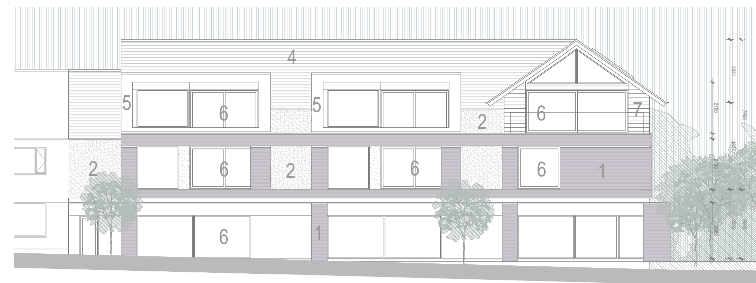
BLOCK C - FRONT ELEVATION SCALE 1:200@A1