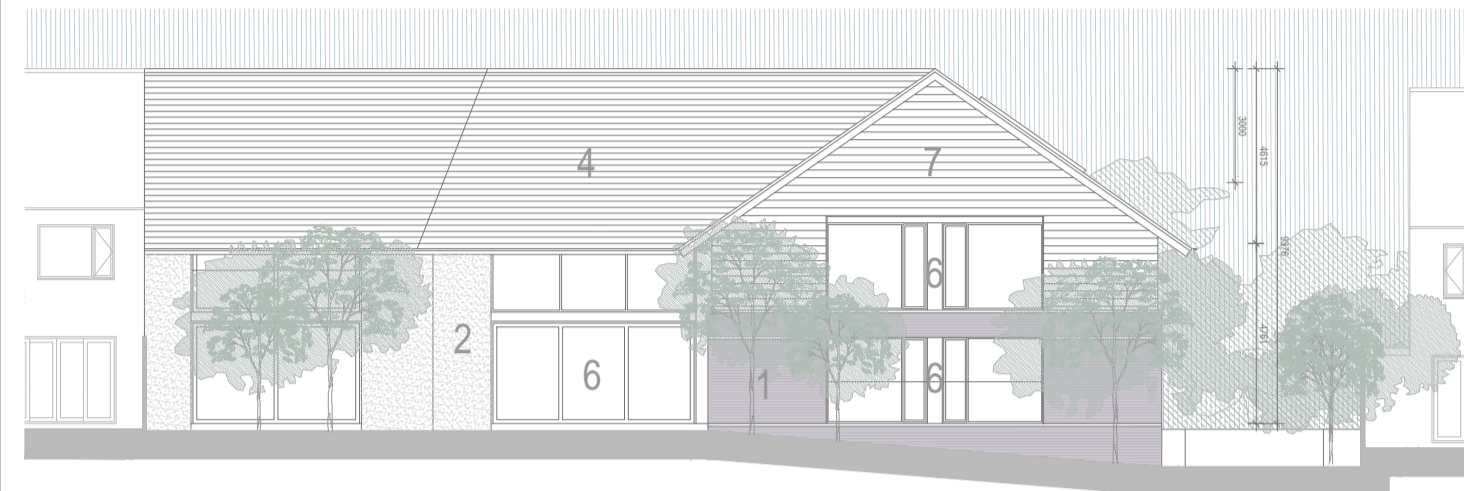
CRECHE - REAR ELEVATION SCALE 1:200@A1